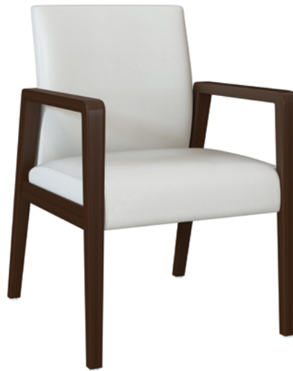
Model: VDNF11 24W 27D 35H 20SW 19SD 19SH 26AH

Key to Kwalu's Valdina Flex Chair design is the flex frame which connects from its seat to the back, enabling a modest amount of flexibility in this short backed chair. The slight movement in the back soothes and adds comfort during long waiting periods. The seat, arms and legs remain stationary providing ergonomic support as the user changes position while angled, contemporary arms facilitate ingress and egress. This chair has two back styles, tall and short. Wall saver back legs ensure the walls remain in pristine condition.